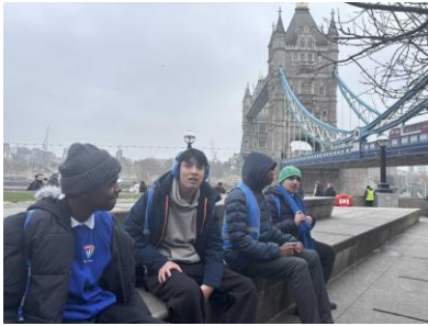
11EZ Bus Tour to visit London Landmarks (Jan 2026)