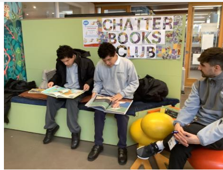
Weekly Trips to the Library (Jan 2026)