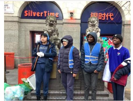
China Town trip (Feb 2026)