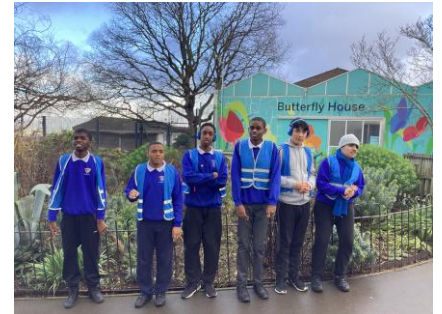
Year 11 Trip to the Butterfly House (2026)