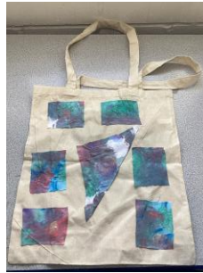
Art Enterprise (Feb 2025)