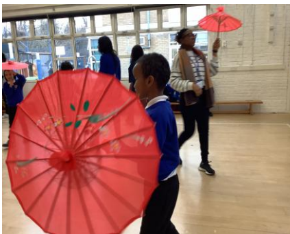
Chinese New Year Dance Workshop (Feb 2026)