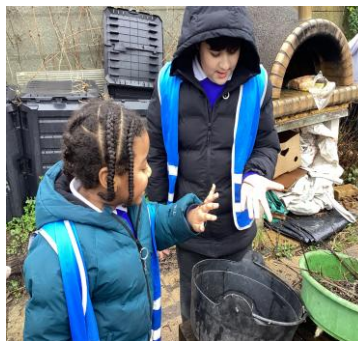
Primary pupils attending Forest School at Rosendale School (Jan-Feb 2026)