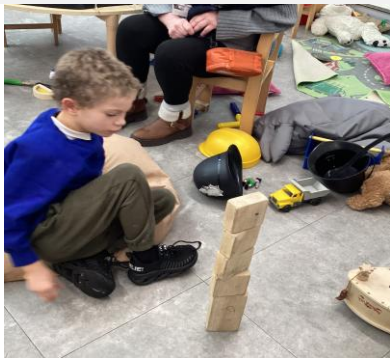
Rosendale School EYFS Visit (Jan 2025)