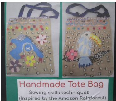
Handmade Tote Bag Sewing skills techniques (Inspired by the Amazon Rainforest)